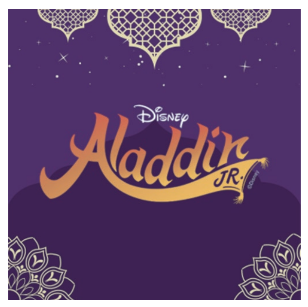
Feb 21-23 & Feb 28-March 2, 2025