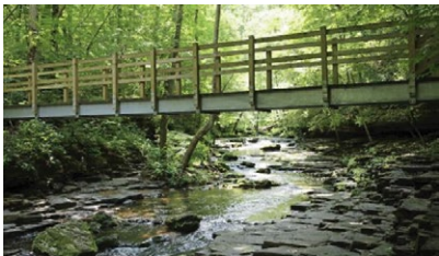
Short Springs Natural Area

Meet at: “Machine Falls Loop Trail Head at Short Springs - Tullahoma”