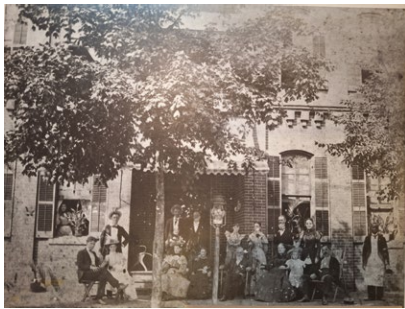
The Franklin House in Cowan A Famous Railroad Hotel Built in 1885

"Music and Hospitality" will be the theme of this year's annual picnic for Franklin County Historical Society as the guest speaker reveals the fascinating connection between Mary Sharp College in Winchester and The Franklin House in Cowan. All are invited to attend the Monday evening, July 15, 2024, 5 p.m. at The Franklin House in Cowan for a potluck supper followed by a program and lecture.