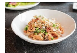
A Bowl Full

Pasta Premier (Fayetteville-Lincoln County Museum) – Fayetteville