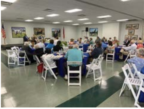
90th Anniversary Luncheon at TWHBEA