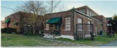
Fayetteville—Lincoln County Museum and Events Center