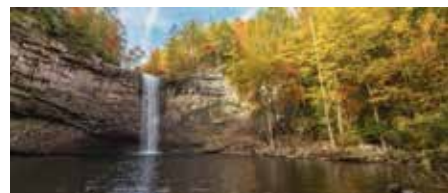
Fiery Gizzard State Park

Fiery Gizzard State Park, once part of South Cumberland State Park, is now a standalone state park. With the significant expansion of South Cumberland over the past decade through assuming operations of