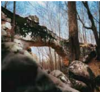
Head of the Crow State Park

Once part of South Cumberland State Park, Head of the Crow is now a standalone state park, named after the area of Franklin County containing the headwaters of Crow Creek. The park joins together four state natural areas to provide better and more outdoor recreation opportunities. Separating Head of the Crow into its own dedicated park will help preserve, protect, and share Tennessee's natural and cultural resources while providing safe and quality outdoor experiences.